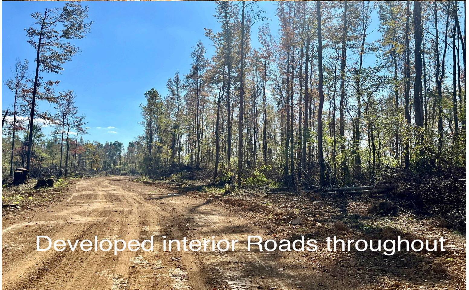
Developed interior Roads throughout