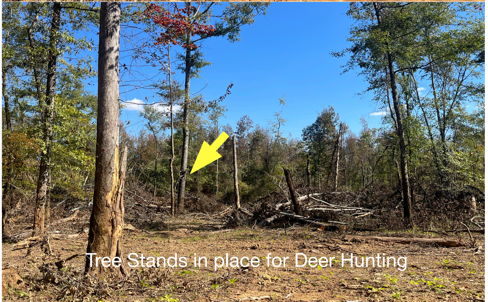
Tree Stands in place for Deer Hunting