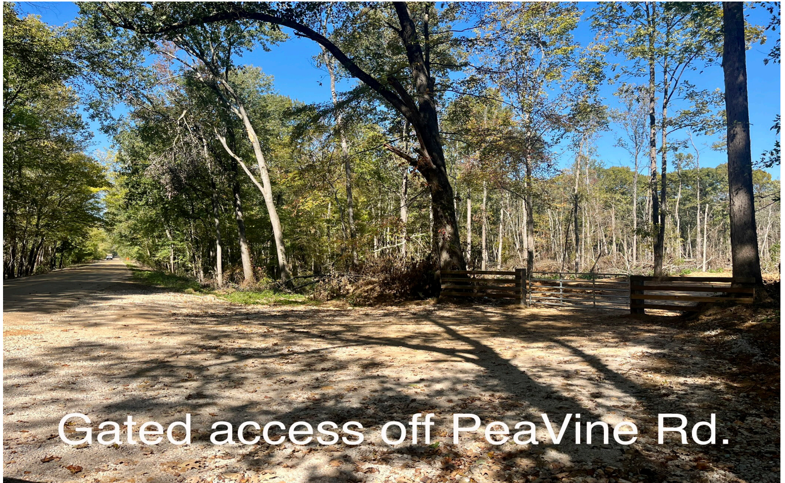
Gated access off PeaVine Rd.