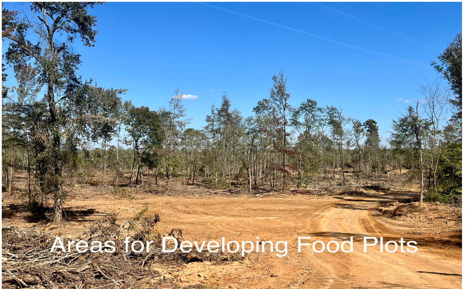
Areas for Developing Food Plots